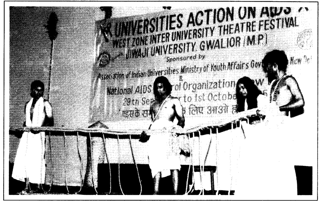
A scene of one Act play by Dr. H.S. Gour University, Sagar at Jiwaji University, Gwalior organised under NACO Sponsored Programme on HIV/AIDS