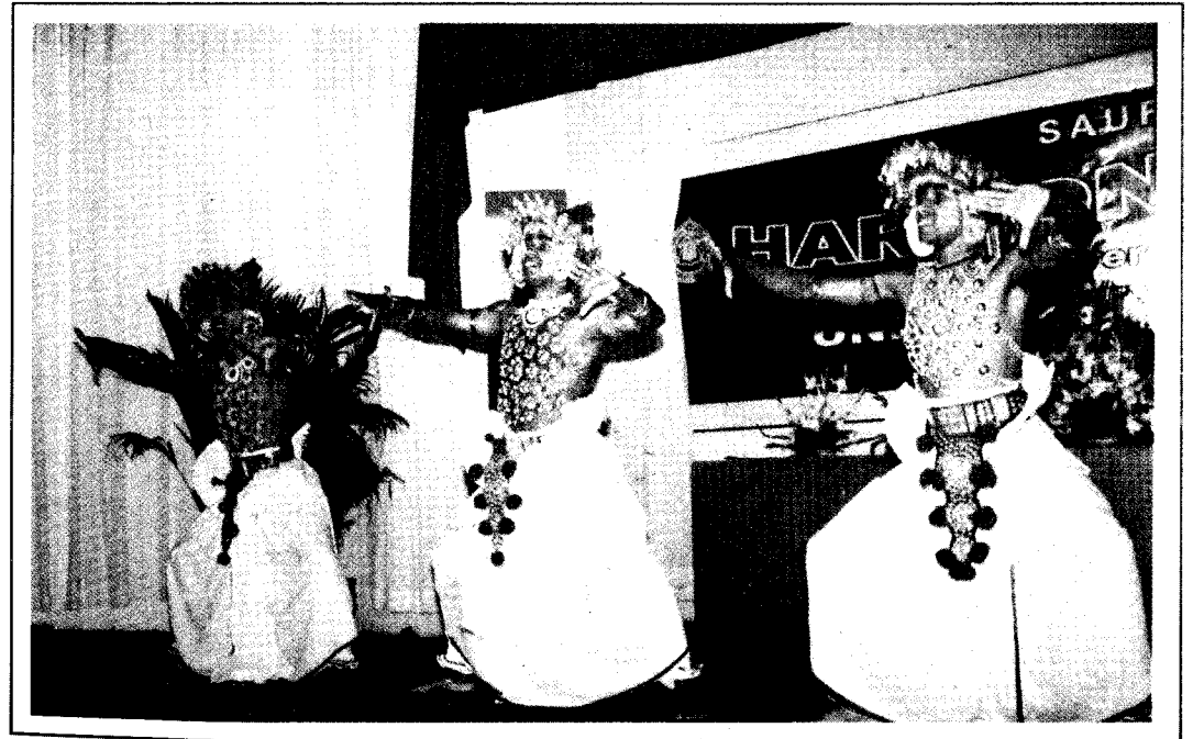
Srilanka performs Folk Dance during saufest at University of Jammu.