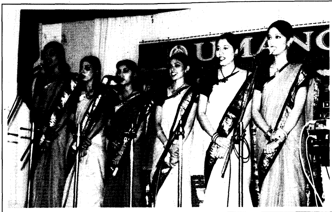
Group song (Indian) by Punjabi University, Patiala during North Zone Youth Festival at University of Jammu.